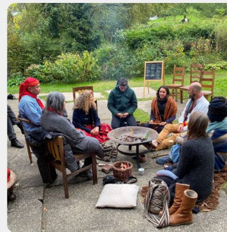
BEEK UBERGEN NETHERLANDS, OCT 2021