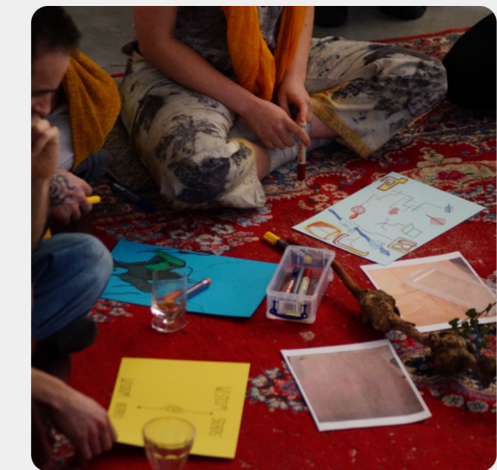
AMSTERDAM NETHERLANDS, DEC 2021