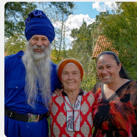
NUEVA TIERRA SPAIN, SEP 2021

Since the beginning, the Tribal Wisdom Foundation focused on its online activities, such as the web portal for stories, profiling Traditional Knowledge Holders and organising online sharing circles and podcast recordings. In 2021, these activities were supplemented by physical gatherings, where corona restrictions permitted, to bring together Wisdom Holders and people representing the Next Generation. Two of these small gatherings were held, which gave much insight into the form in which these sharing circles could be scaled, and the impact they have on all participants. Sharing knowledge, questions and truly listening to each other is an ancient human practice. It's simple yet profound as being acknowledged and heard are basic needs.